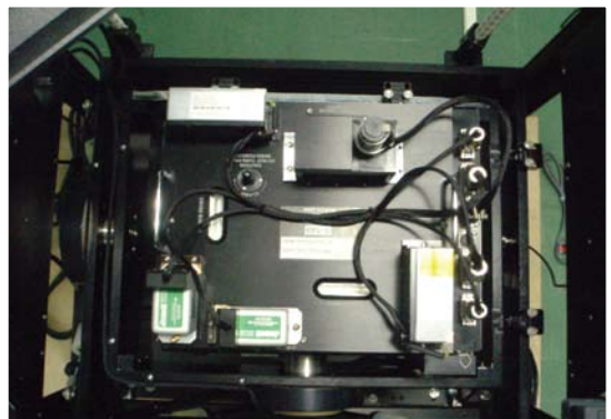
Detail of the gimbal-mounted gravity sensor.